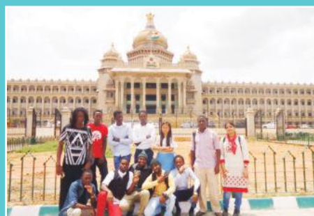
International Students in front of Vidhana Soudha