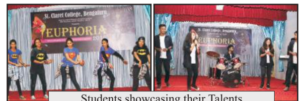
Students showcasing their Talents