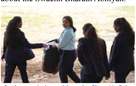
Students actively participate in Clean-Up Drive in Khata Nagar

initiative aimed to create a cleaner environment and promote awareness about the Swachh Bharath Abhiyan.