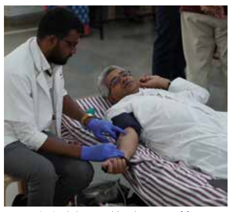
Fr. Principal donates blood as part of free blood donation camp

The Youth Red Cross and Red Ribbon Club in association with the Indian Red Cross, Karnataka and Rotary Jalahalli and St Claret Rotaract Club organised a free blood donation camp on 19 May 2023. The students, faculty members and staff of St. Claret College were the target audience. A total of 259 members donated blood. Blood donation is a voluntary procedure that can help save lives.