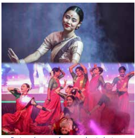
Eastern dance performance by students on RECIPRO-2023 Cultural and Arts Fest

events like ethnic dances, ethnic walk & ethnic music competitions organized for the students. The enthusiastic participation of first-year undergraduate students led them to secure the coveted overall championship.