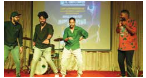
Alumni perform on Homecoming meet

Claret Alumni Association in collaboration with Claret Centre for Community Development organised an Extension Activity MAITRI 2023' – A visit to an orphanage, in collaboration with Saraswathi