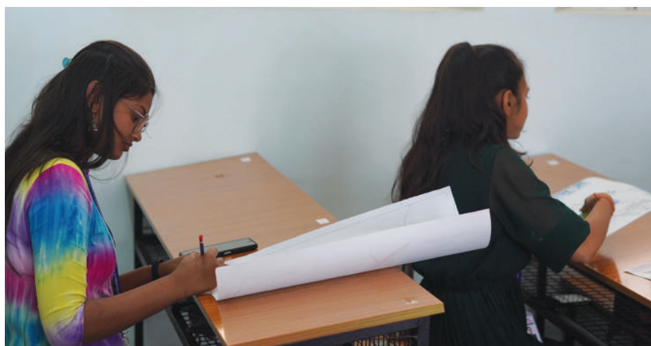
Students participate in poster making competition as part of PICK WICK, Literary fest