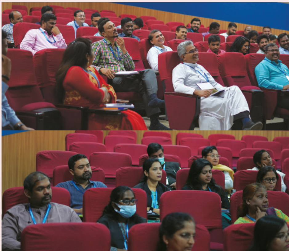
Faculty members of SCC attend session on best practices conducted by IQAC

From 23-24 March 2023, the Professional Development Program “Aarambh” was organised by IQAC at the college for the faculty members. The program involved various sessions for the faculty, like research methodology, publication, session on POSH Act and Income Tax. The purpose of professional development is to give professionals the opportunity to learn and apply new knowledge and skills that can help them in their jobs and further their careers. Professional development is all about building skill set and knowledge base on respective fields.