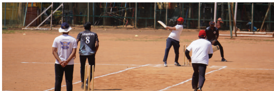
Students participate in Alumni cricket selections