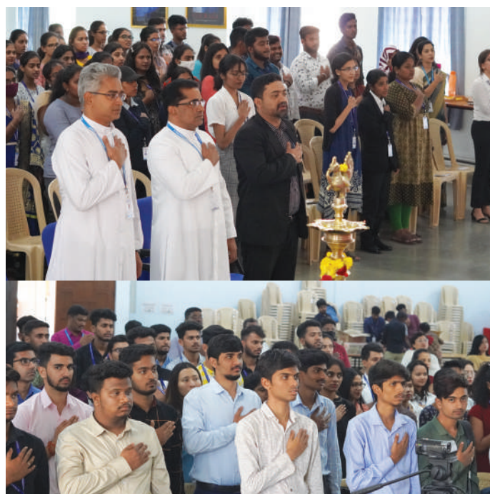
Principal, faculty members and students participate in the Oath taking ceremony during PG academic year inauguration