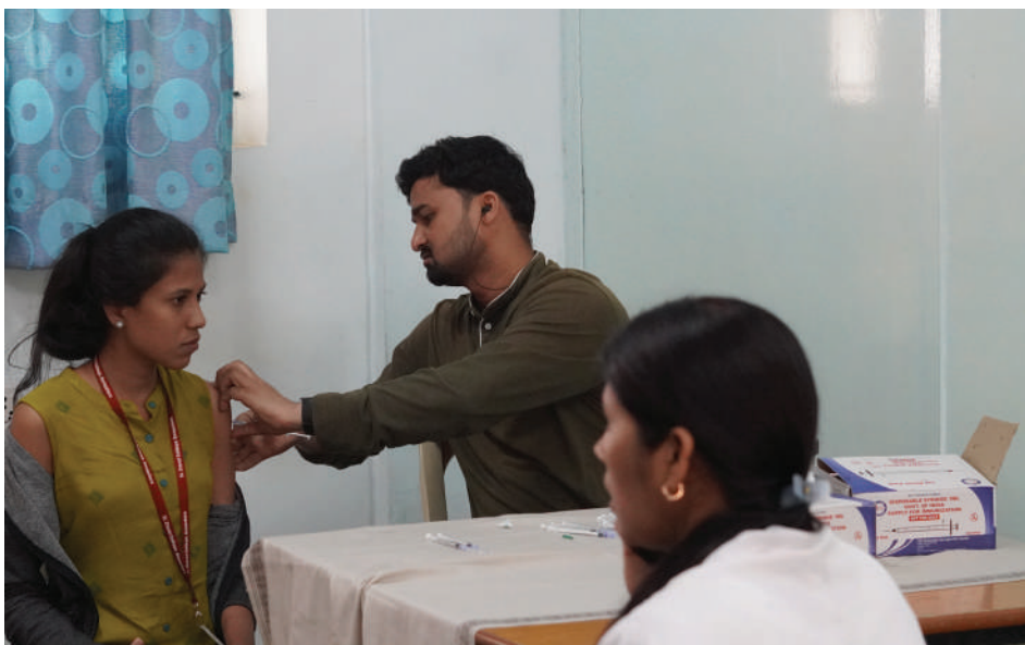
Rotaract Club organises booster dose vaccination drive

and students of St. Claret Institutions to keep them protected from Coronavirus on 21 January 2023. The Rotaract Club in association with Jalahalli Primary Healthcare Centre jointly organised the drive. A total of 106 Claretines benefited from the vaccination drive.