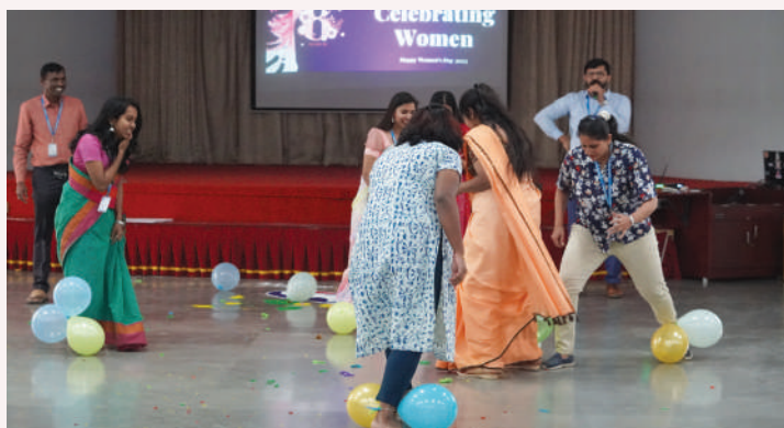
Faculty members participate in fun games during Women's Day celebrations

staff. The day also marks a call to action for accelerating gender parity. This day is observed worldwide as groups come together to celebrate women's achievements or rally for women's equality. It is an opportunity to celebrate women's accomplishments.