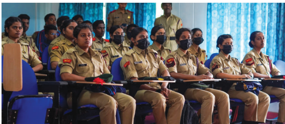
NCC students attend National Seminar on Cadets Engagement Programme on India G20 Presidency.

The cadets were able to understand the concept of G20 and the program boosted the confidence of the cadets as