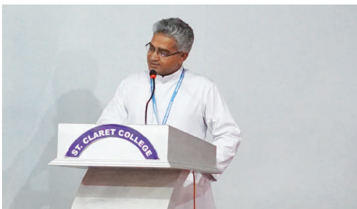
Fr. Principal addresses the students during the inaugural ceremony

On 14 February 2023, PG academic year of SCC inaugurated the new academic year with the blessings of God almighty at the college auditorium, anticipating a bright journey of learning and development. The event began with the invocation song and lighting the lamp followed by a motivational and visionary speech by the Principal.