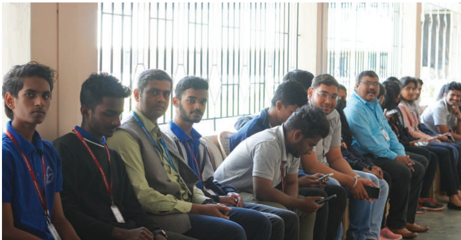
Claretines attend HIV awareness programme