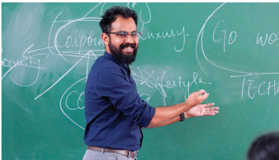
Claret Alumni interact with students and gives them hands-on training

January 2023. A total of 21 alumni representing various industries were part of this workshop sharing their expertise and knowledge with the final-year UG and PG students. Alumni networks can be a valuable resource for both current and former students. For current students, alumni networks provide mentorship and guidance and for former students, it provides a way to stay connected to the school and other alumni. The alumni of SCC is an efficient team of people who continue to serve the college by providing advice and mentorship to the students in both academic, cultural and co-curricular activities.