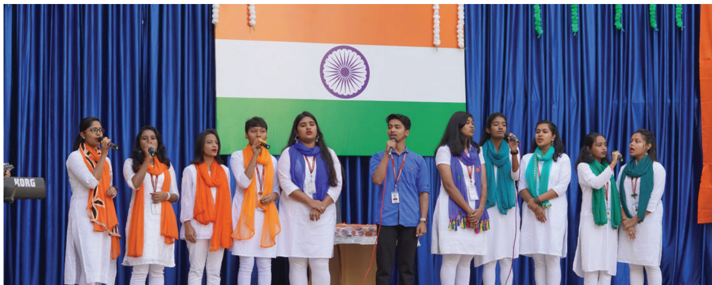
Students sing patriotic songs as part of Republic Day

26 January 2023 at the quadrangle. Disciples India Learning Forum in association with St. Claret College