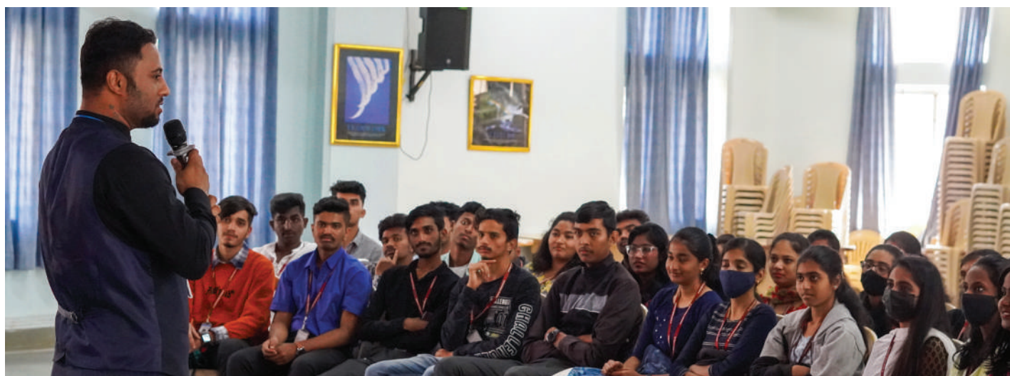
Third year students attend LSDP session

taught the value of maintaining a balance between materialistic success and profound inner peace without which the real essence of life cannot be understood and problems like depression and anxiety will further increase.