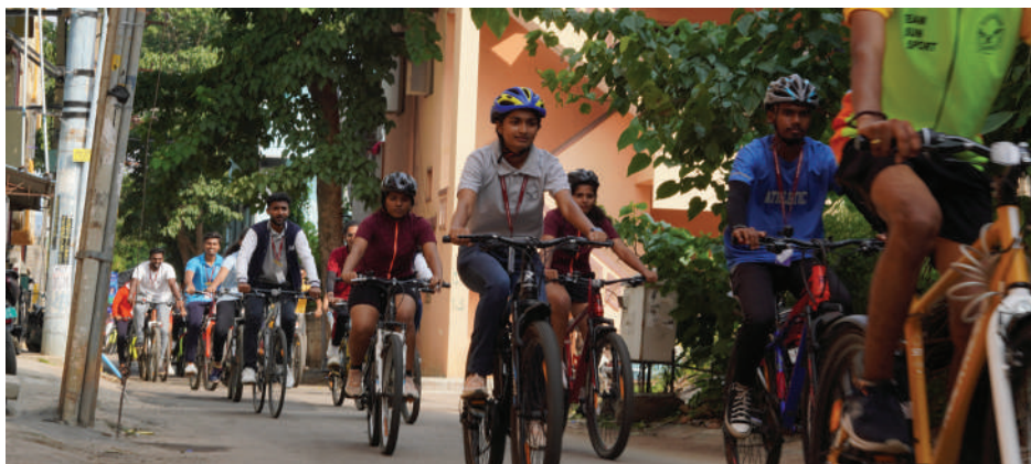
Students participate in Intercollegiate road cycling selections

Bangalore University organised the Inter-collegiate Road Cycling selections for all the students of various colleges coming under Bangalore University to boost the sportsman spirit and provide a forum to exhibit their talent in the sports field on 03 February 2023. This event was conducted in the men and women category.