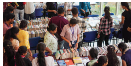
Students attend book exhibition in the college reading room

The Department of Library and Resource Centre organised a book exhibition for the academic year 2022-23 on 14 March 2023. The book exhibition display was done in the reading room. Sumukha Publishers displayed various publication books on Commerce, Management, Computer Science, General, Competitive exams, Social work and Psychology.