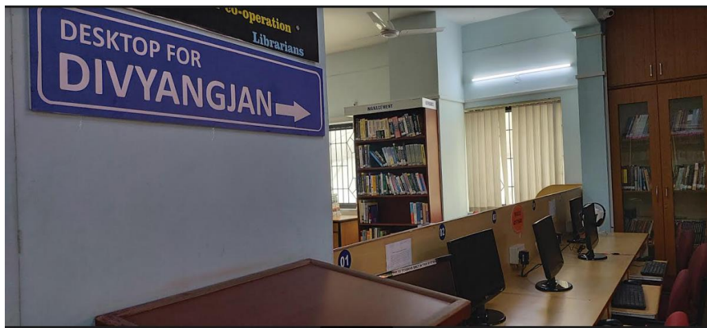
Library corner for Braille Software and the Librarian handling the session for the students

Braille screen reader software NVDA (Non-Visual Desktop Access) is available to support the end users and it reads aloud the text on the screen in a computerized voice.